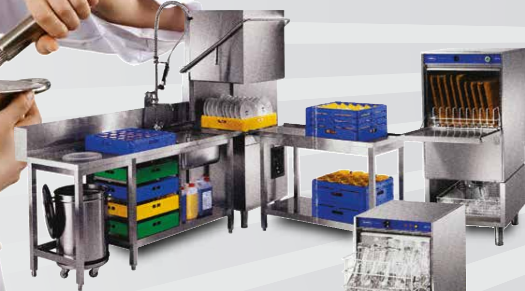
Series ECO - OPT Dishwashing technology.