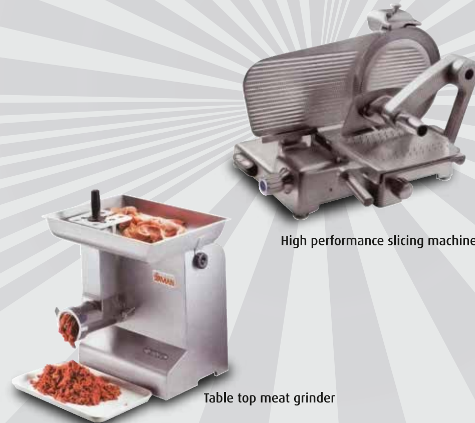
High performance slicing machine