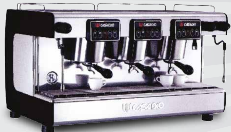
Cappuccino machine - 2 stations & 3 stations