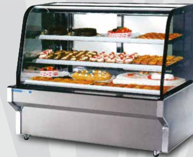
Stainless steel cake display units