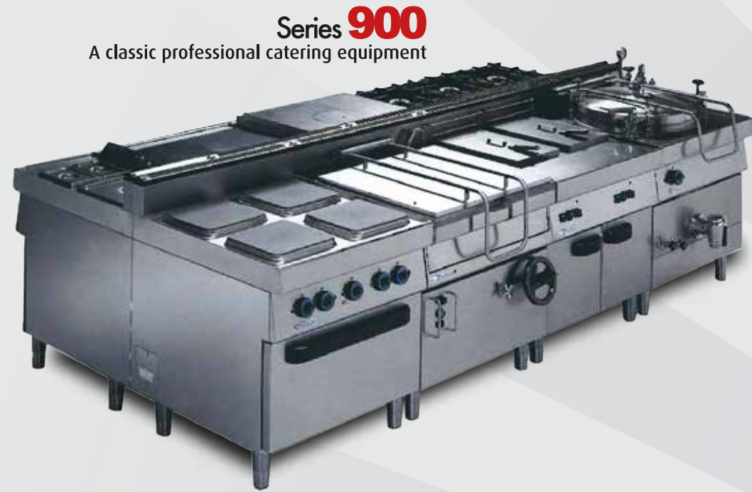
Series 900 A classic professional catering equipment