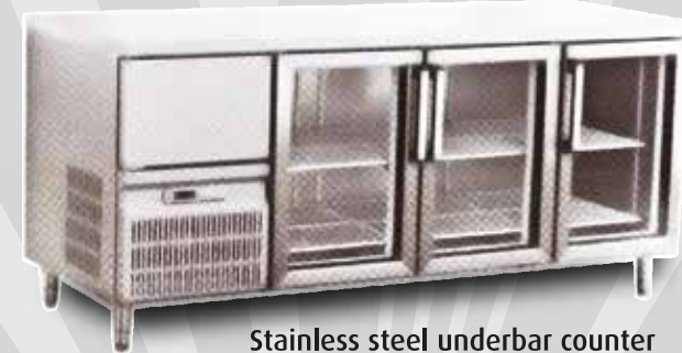
Stainless steel underbar counter