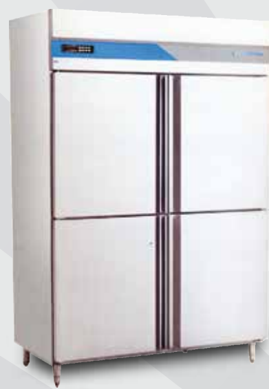
Stainless steel refrigerator