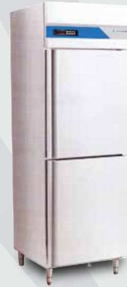
Stainless steel freezer